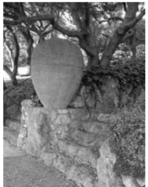
A stone urn marks the bottom of Indian Trail which leads upward to Great Stoneface Park.

Many of the pathways join parks and make them more accessible. Our interests require treasured open spaces to be kept usable and beautiful. Measures S & W can do that.